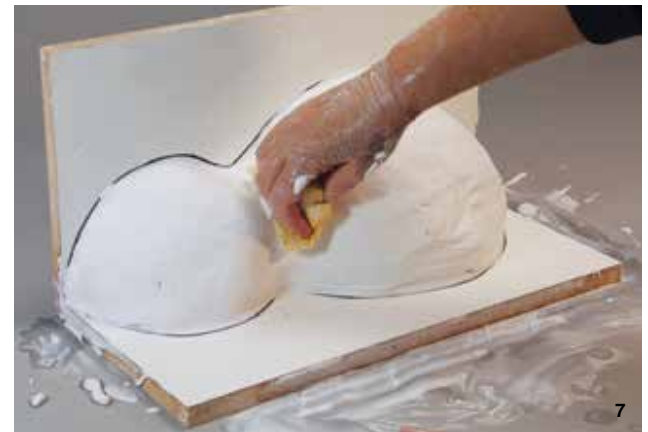
1 Draw silhouettes of symmetrical shapes, then make paper templates by folding the paper in half and cutting out the shapes. These must be symmetrical to work for the quarter-segment mold process. 2 Trace the outline of your paper template onto the right-angle support boards. Next draw a line ½ to 1 inch (depending on size of mold) above this outline to mark the thickness of the plaster mold. Begin filling in the space with clay to create the solid clay model. 3 If you want a faceted, fluted, or carved surface, begin carving the solid clay form with a trimming tool. Other options: leave it smooth, stamp texture, or add bas-relief elements. 4 Push toothpicks into the high points on the clay model, leaving ½ inch exposed to make it easy to gauge the depth of plaster as you apply it. 5 Begin pouring a thin coat of plaster over the clay model that will flow into and preserve any texture on the model and prevent bubbles and gaps in the surface of your mold. 6 Continue to add plaster as it thickens, building your mold to the depth that you need. Pull the toothpicks out as the plaster is setting up to avoid having holes in the surface of the finished mold. 7 Smooth the plaster surface of your mold with a sponge and water as it starts to solidify.

Because Gouthro can press the overall forms so quickly, she chooses to focus her time and unleash her creativity individualizing each piece with intricate or multifarious decoration. Pattern and intensity of color are of prime importance for Gouthro, “I live for color—it’s like food for me, I can’t be without it.” Beyond nature’s color palette, Gouthro draws on the richness of textiles from around the world. Her wanderlust has taken her to many