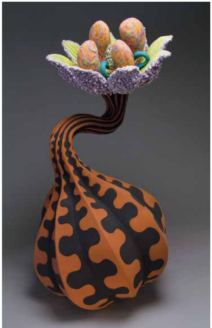
Top: Aurlia gouthroii Resupinus , handbuilt and segmented terra-cotta clay, slips, stains, underglazes, glazes, 2014. Bottom: Aurlia gouthroii Undulate , handbuilt and segmented terra-cotta clay, slips, stains, underglazes, glazes, 2014.