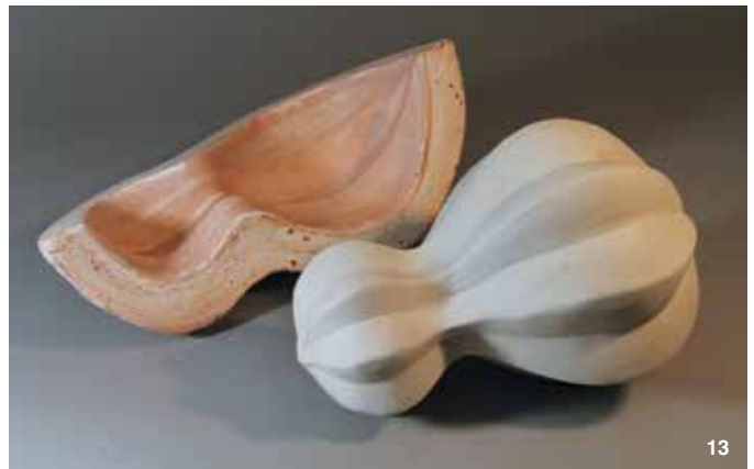
8 The completed and dried segment mold with the clay model removed. Dry your segment mold well before you use it so it will be easier and faster to use. 9 Begin using the plaster segment mold, pushing a wet clay slab in to the mold. Experiment with different ways to push clay into your mold using coils, balls, or strips of clay if you want additional texture. 10 Use a rubber or wooden rib to push the clay into the mold to ensure a good transfer. 11 Cut the edges and leave the clay slab in the mold to stiffen up or flip out and prop to stiffen. 12 Four sections pressed and ready to be assembled by scoring and slipping. Timing and slipping and deep scoring are the key to successfully building your completed form. 13 Four sections put together when leather hard to create the whole segmented form, then coated with white slip.

in her syllabus at Red Deer College in Alberta, Canada, and has subsequently continued to forward images of her students' work that is rooted in the method back to Gouthro.