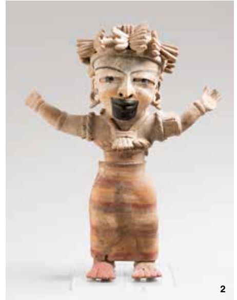
1 Exterior of the Gardiner Museum, sculpture by Jun Kaneko in the foreground. 2 Figure of dancer with pastillaje headdress, 23 in. (58 cm) in height, earthenware, red on cream slip, asphalt paint, Mexico, Veracruz, on view at the Gardiner Museum. Gift of George and Helen Gardiner.