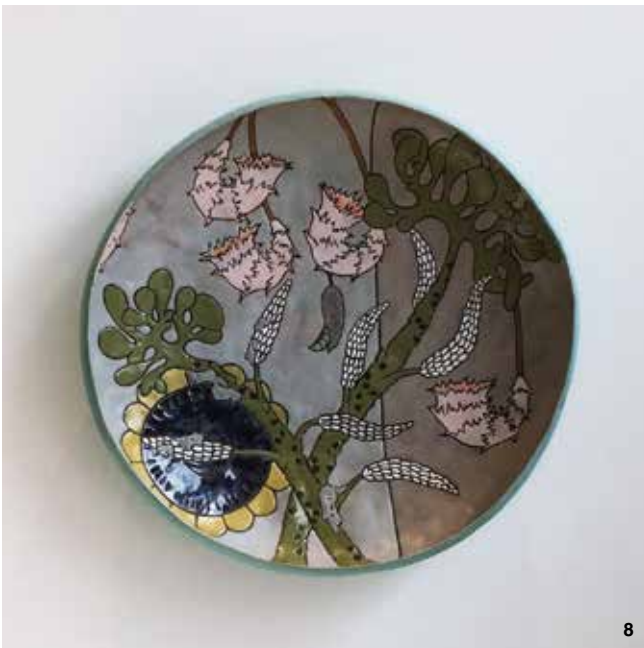
5 Christopher Reid Flock's Integration/Disintegration Cup Saucies , wheel-thrown stoneware, vitrified, acrylic paint, 2016. 6 Exterior of the Canadian Clay and Glass Gallery. 7 Reid Ferguson's Jacob Street , 10 in. (26 cm) in diameter, glass, enamel, cast concrete, 2016, on view at Craft Ontario. 8 "Teaching Materials" exhibition at Craft Ontario, Marc Egan's Emergence , stoneware, glaze, 2017.